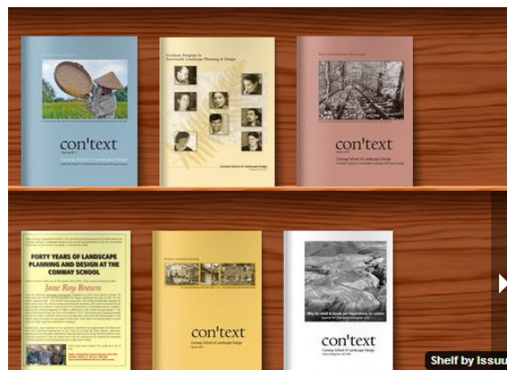
Conway publications at tinyurl.com/conwaycurrents

The Conway Board of Trustees approved in concept the 2009–2014 Strategic Plan, “Sustaining a Community of Life-Long Learners.” The staff and board will be working together in FY 2011 to fine-tune and implement this plan.