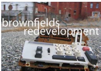
Priscilla Novitt '07